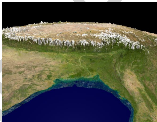
Figure 1. The Geophysical Setting of Bangladesh

36. Bangladesh is situated at the unique juxtaposition of the composite, sprawling, interlinked Ganges-Brahmaputra-Meghna (GMB) river systems, the second largest river system in the world, which drains an area of 1,086,000 km 2 from China, Nepal, India and Bangladesh and has an annual discharge only second to the Mississippi delta. Being located just at the foothill of the Himalayan massif in the north with a 6% south-north gradient meeting the Bay of Bengal in the south. Almost the entire landform of Bangladesh, except for 10% of hilly area, is like a sheet of paper, making it more vulnerable to climate change. The U.S. National Oceanic and Atmospheric Administration image in Figure 1 shows a pictorial view.